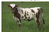
Win W Dew