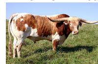
MY MY MY